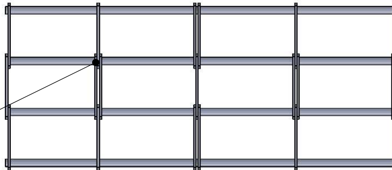
DOUBLE BRICK PATTERN