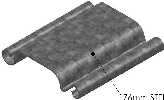
76mm STEEL SLAT