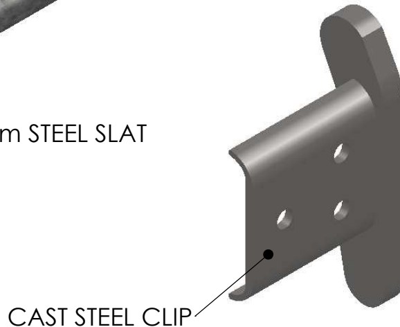
CAST STEEL CLIP